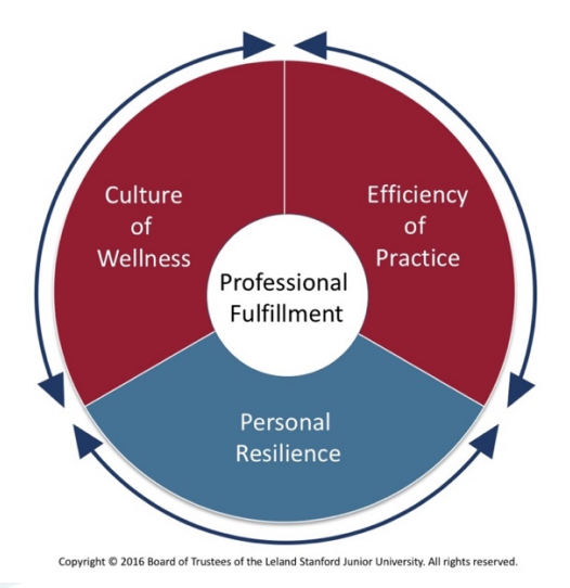
Figure 2 Stanford WellMD Center Conceptual Framework for physician wellness. This model was devised based on identified drivers of physician burnout and emphasises the important role of the systemic interventions in promoting professional fulfilment for clinicians. Reproduced with permission from WellMD Center.

The model conceived by Dr Patty de Vries from the Stanford WellMD Center, which has been taken up by multiple institutions around the USA and the world, focuses on the drivers of burnout and poor wellbeing. It divides drivers and solutions into three domains: Culture of Wellness, Efficiency of Practice, and Personal Resilience (see Figure 2 , below). This model highlights that the bulk of responsibility for reversing the current problem lies with healthcare organisations rather than individuals (only one of the three domains targets individuals), and aids organisations in designing or selecting programs that address specific drivers within their context.